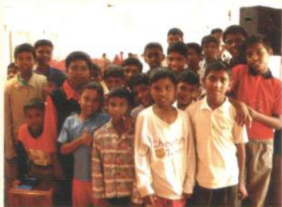
Orphans from Good Samaritan Fellowship

Matthew 9:35-38 above encapsulates the essence of our ministry in India. Truly, the harvest is plentiful, so we pray for more opportunities to minister and bring the gospel of the kingdom to the people there. As a team, we were truly blessed by the love and hospitality of the brethren in India. We give God all Glory for what He is doing and will continue to do in India.