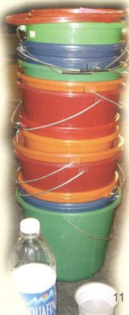
Back to basics... They collected their offerings in these colourful pails