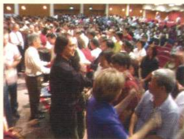
And the multitudes came

Though we partnered with fewer churches this time round, which resulted in less publicity, God saw to it that each flyer that went out reached the right people; those He wanted to attend the meetings. Thousands attended and were deeply touched over the eight days. Furthermore, despite the administrative and logistical challenge of six different venues, thousands of attendees, including hundreds of crutches, wheel-chair and bed-ridden hopefuls, it was the power of the Holy Spirit that made it all possible.