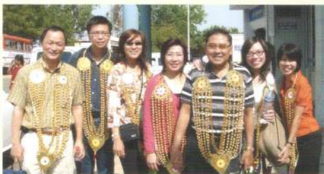
The team of 7