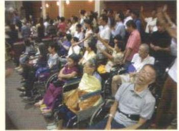
Seeking a miracle

“We saw cripples, handicapped and many in wheelchairs get up and walk. Crutches and walking sticks were abandoned and people were set free.”