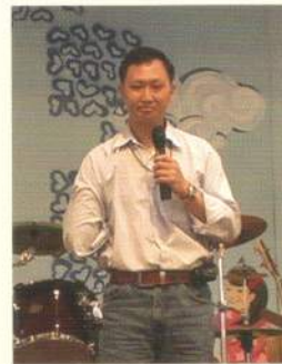
Testifying how God had healed him of cancer!

Mauritius has become a second home for the Covenant Vision team. The hospitality that has been extended to us, the numerous gifts that have been showered upon us has been testament to the generosity of our hosts in Mauritius. However the greatest gift they have given us is the opportunity to have served God which has undoubtedly left an indelible mark on our lives. Hallelujah!