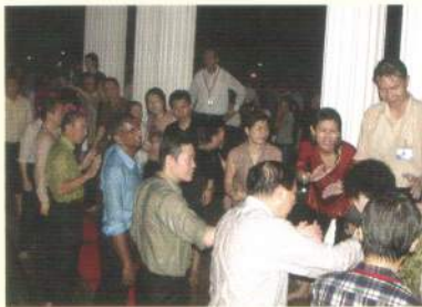
Stirring the waters at Bethesda

As a ministry, we witnessed a great and awesome joy in what God had done. We attribute ALL to Him and Him alone. We are honoured to have been used by God and we are looking forward to more conferences that He would have us organise for His glory.