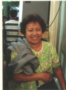
Healed on the spot of a paralysed arm!

The rallies that were held over the four nights of crusades saw over 740 recorded salvations. Even more came forward for healing and the anointing of God was evident. Testimonies of physical healing and financial provision encouraged all that God is able to do exceeding, abundantly above all that we could ask or imagine. The sight of a man crippled by pain and weakness throwing away his cane with joy was one to behold. The faith that abounded in all was immeasurable. The presence of the Holy Spirit truly touched one and all.