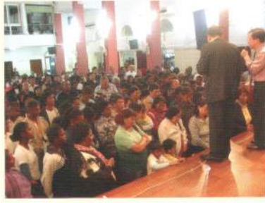
Far left: Co-labouring at the Youth Explosion!